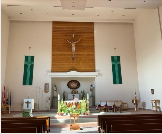
The latest happening in Keswick: A picture of the Sanctuary of our Church in Keswick, Ontario.